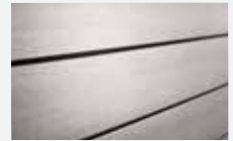
BRUSHED NICKEL SIDES