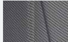
CARBON FIBER GLOSS CORNERS