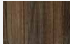
MODERN FARMHOUSE MATTE CORNERS