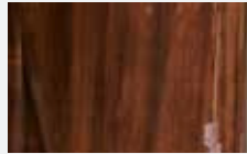
BRISTOL BROWN GLOSS CORNERS