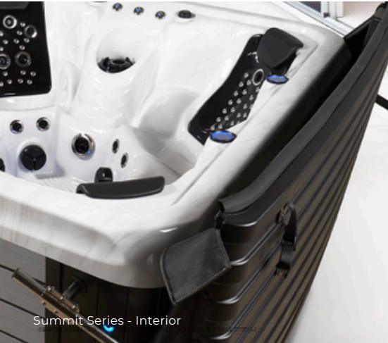
Summit Series - Interior

Sophisticated curb appeal with luxurious features designed to meet your every hydro-therapy desire mark the Strong Spas Summit Line. We've thought of every detail, from standard SpaTouch full-color touchscreen controls and DURA-SHIELD HardCover, to optional, innovative WIFI connectivity.