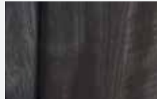
BLACK ONYX GLOSS CORNERS