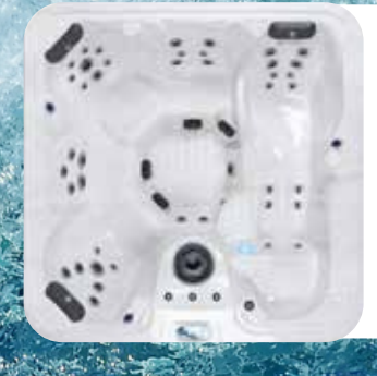
ASCENT DE-SL50 85 x 85 x 36" 400 USG Lounger Seats up to 5 240V