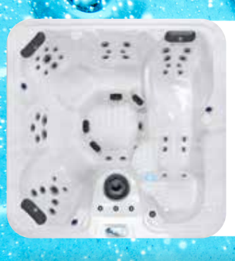
ASCENT DE-SL50 85 x 85 x 36" 400 USG Lounger Seats up to 5 240V