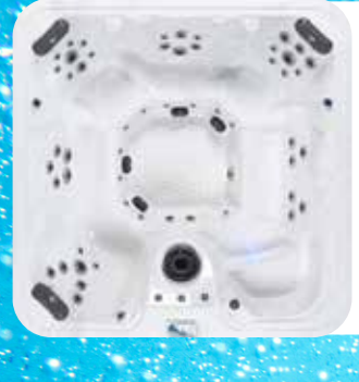
ASCENT DE-S60 91 x 91 x 36" 480 USG Non-Lounger Seats up to 7 240V