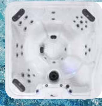
ASCENT DE-S30 74 x 74 x 36" 300 USG Non-Lounger Seats up to 6 120V/240V PLUG & PLAY