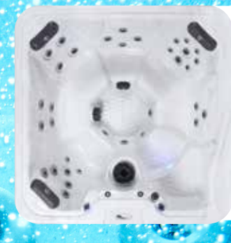
ASCENT DE-S40 74 x 74 x 36" 300 USG Non-Lounger Seats up to 6 240V