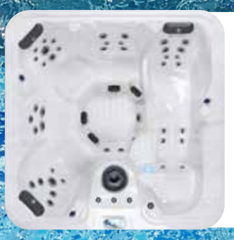
ASCENT DE-SL50 85 x 85 x 36" 400 USG Lounger Seats up to 5 240V