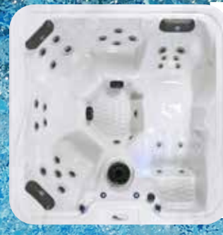
ASCENT DE-SL30 74 x 74 x 36" 300 USG Lounger Seats up to 5 120V/240V PLUG & PLAY